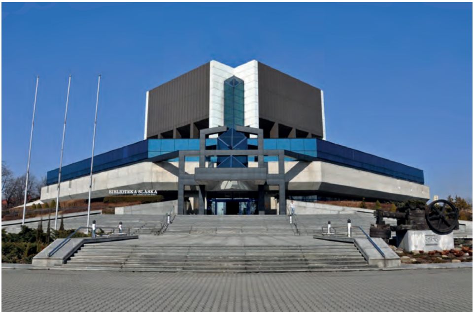
Photo 2. The Silesian Library, the tower part contains automated stacks, Katowice, 1992