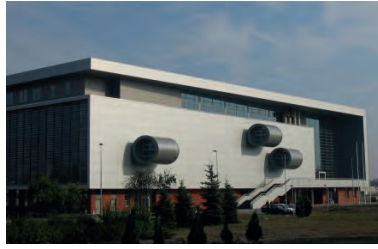
Photo 6. Gdansk University Library, 2006 [source: http://www.bg.ug.edu.pl/o-bibliotece/prezentacja-biblioteki ]