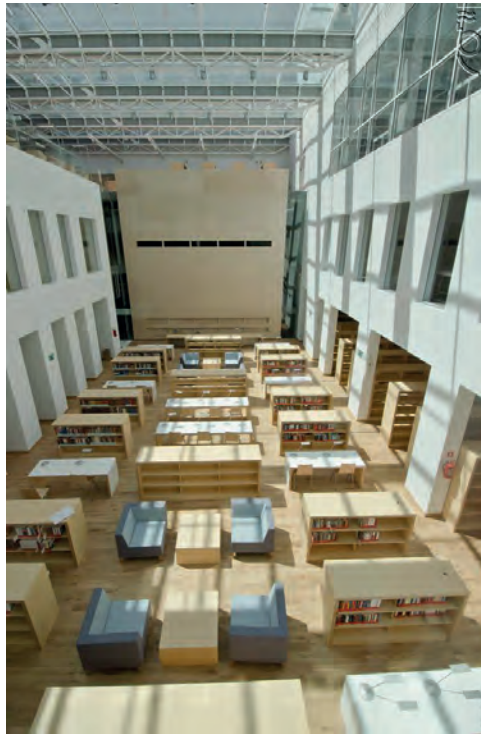
Photo 11. „Koszykowa” – Main Library of the City of Warsaw, Faustyn Czerwijowski new reading room, 2015