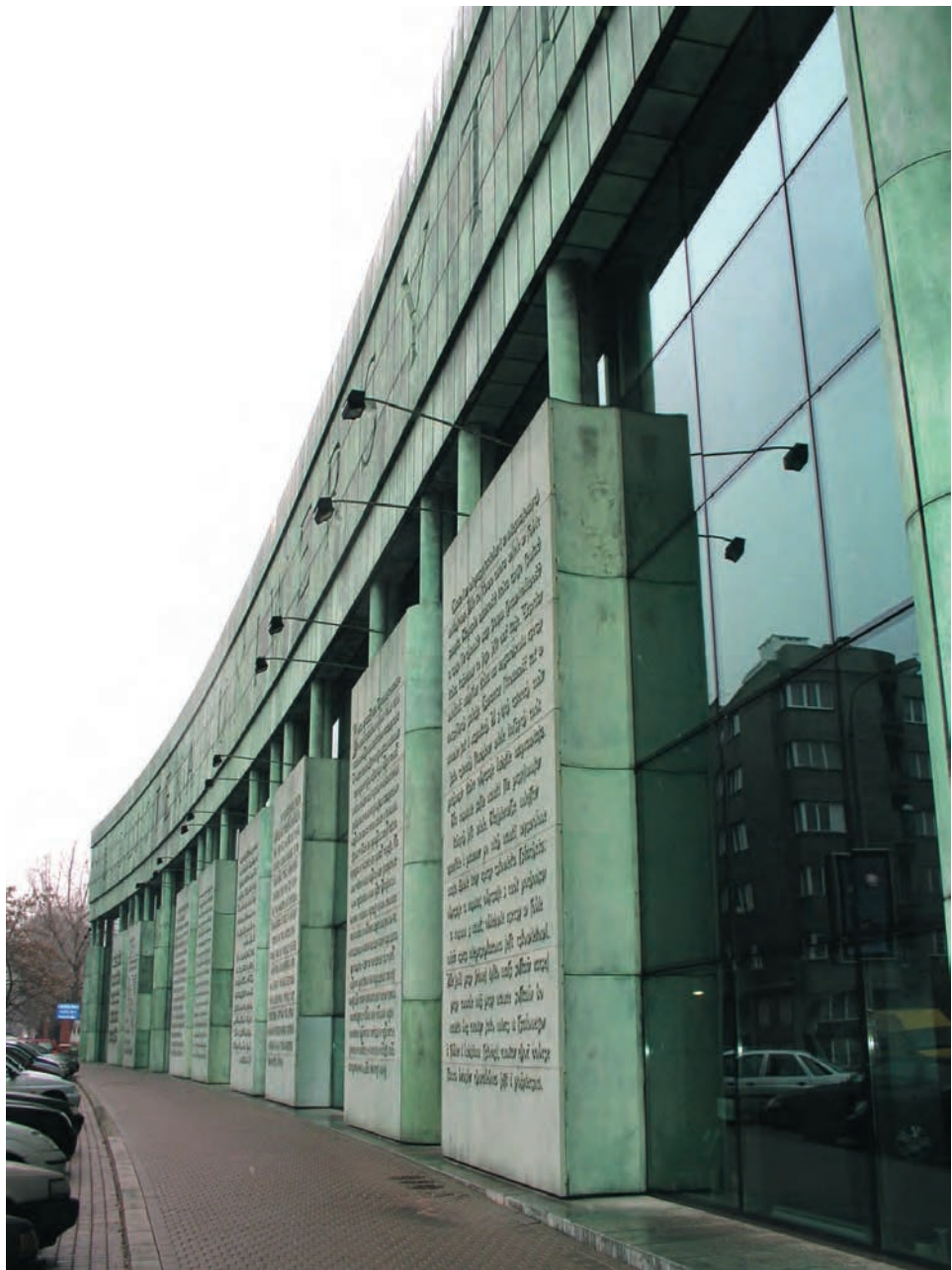
Photo 3. The University of Warsaw Library, 1999, the front, so-called “culture” elevation – displaying quotes from various texts of culture and science