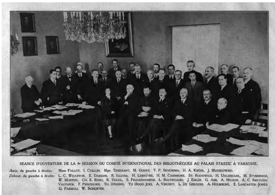
Photo 2. Participants of the inaugural meeting of the 9th IFLA Session at Staszcz Palace in Warsaw, 31 May 1936.

peared. Nevertheless, an extensive account of the Congress was provided as a report in two volumes dedicated to the 4th Congress of Librarians ( IV Zjazd Bibliotekarzy Polskich w Warszawie. Protokoły [4th Congress of Polish Librarians in Warsaw. Protocols], 1936).