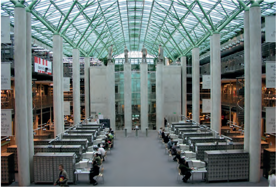
Photo 4. The University of Warsaw Library, main hall holding the Library catalogs, surrounded with open stacks collections