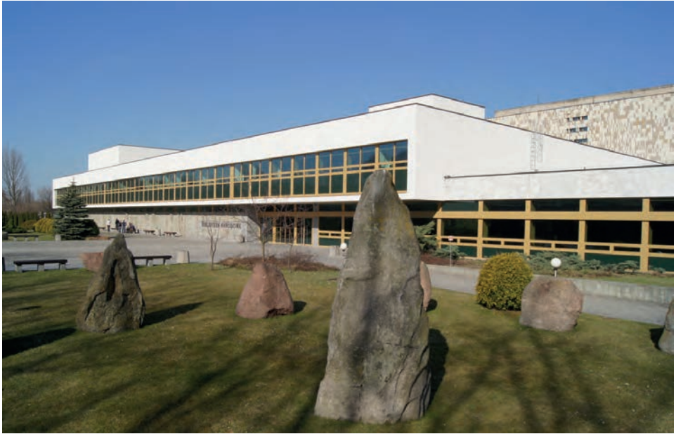
Photo 1. National Library of Poland, 1981, main entrance, glacial erratics in the foreground