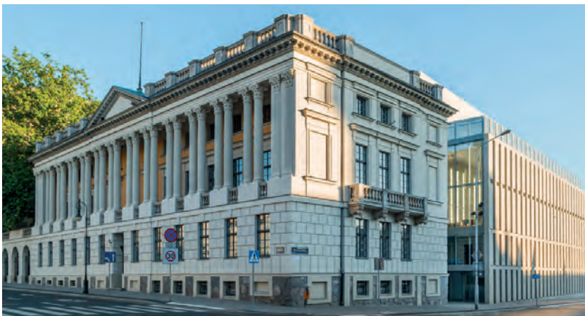
Photo 12. The Raczyński Library, the old building with a new extension, Poznań, 2013