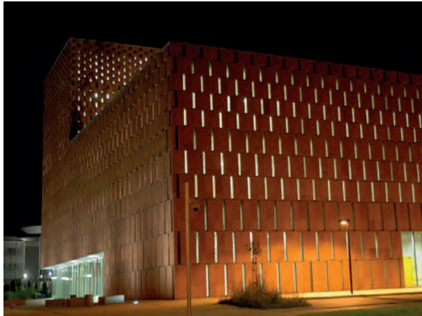
Photo 8. The Center of Scientific Information and the Academic Library (CINiBA), Katowice, 2011