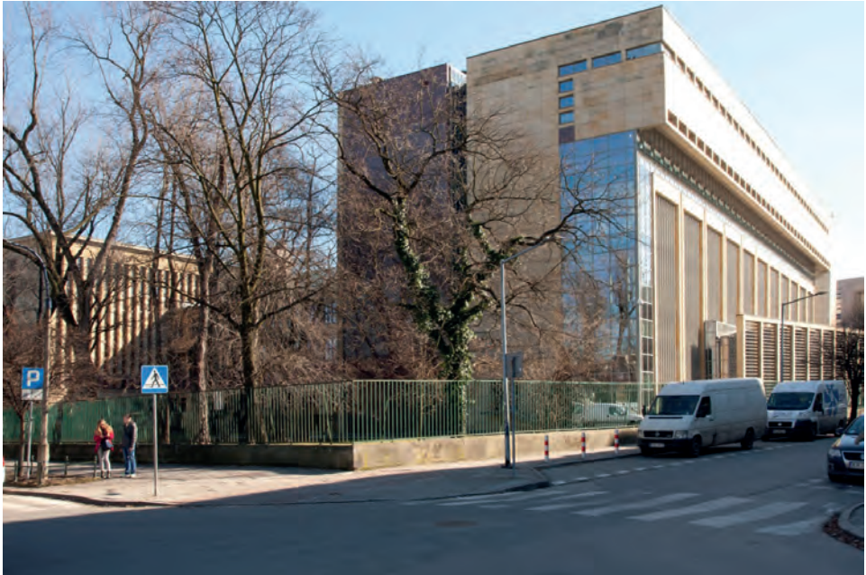
Photo 9. The Jagiellonian Library, a new building with the former premises and the passage joining both buildings in the background, Kraków, 2001