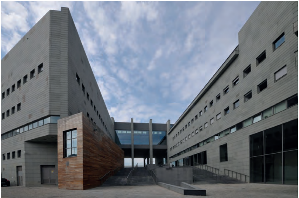
Photo 5. Wrocław University Library, 2005