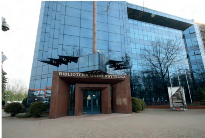
Photo 7. Łódź University Library, 2006, side by side with the former Library premises (visible in the right upper corner)